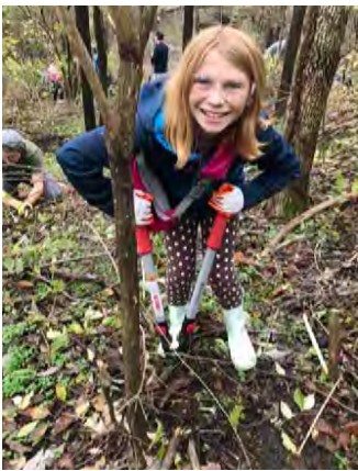
Beech Grove Hill area cleared of invasive plant species

In all, more than 526 volunteers served nearly 1194 hours as a part of the Restore the Forest program. These volunteers removed invasive plant species from approximately 6 acres of forest on Beech Grove Hill and planted 239 native seedlings. IRCLs alone gave more than 150 hours to the program. We are deeply grateful for our community of volunteers – THANK YOU!!!