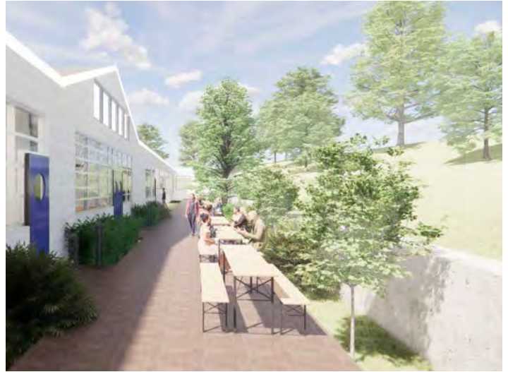
Re-imagined north patio

The Shelby Naval Commons will be a new gateway to our amazing park and support our community.