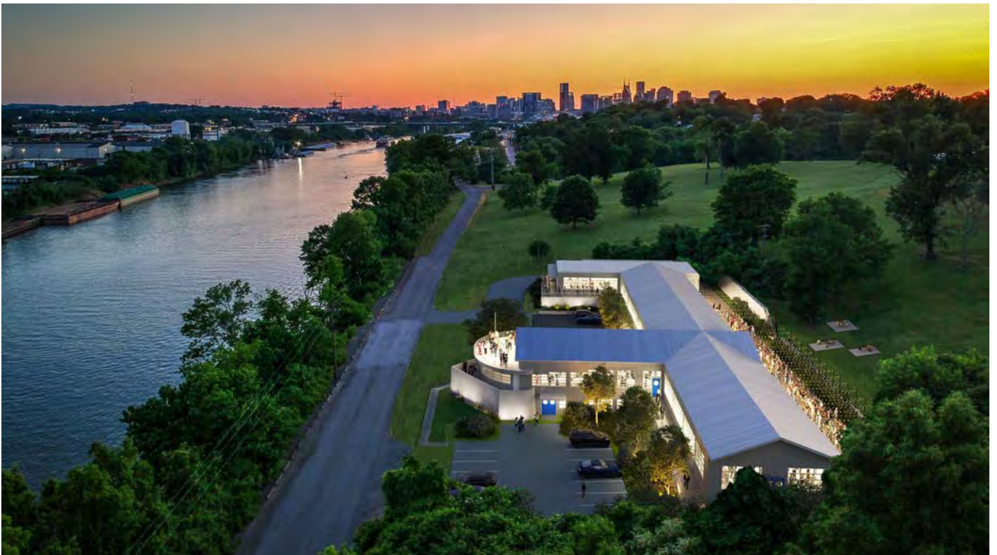
Re-imagined Shelby Naval Commons, the Cumberland River, and Downtown Nashville